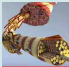
Anatomy of a muscle fiber, showing multiple nuclei (blue) and internal myofibrils containing actin and myosin, and surrounded by mitochondria.